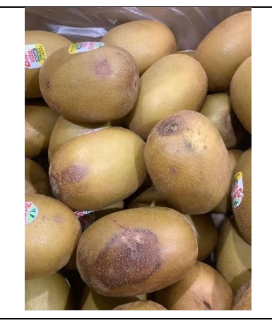
Scuffs and skin marks.